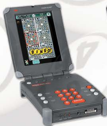
Lil' Champ™ Handset

Here's just a sampling of the specialty games and gaming devices Video King has to offer:*