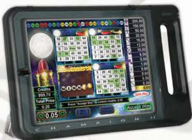
Champion II™ Tablet