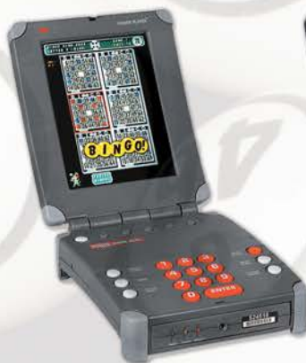
Lil' Champ™ Handset

Here's just a sampling of the specialty games and gaming devices Video King has to offer:*